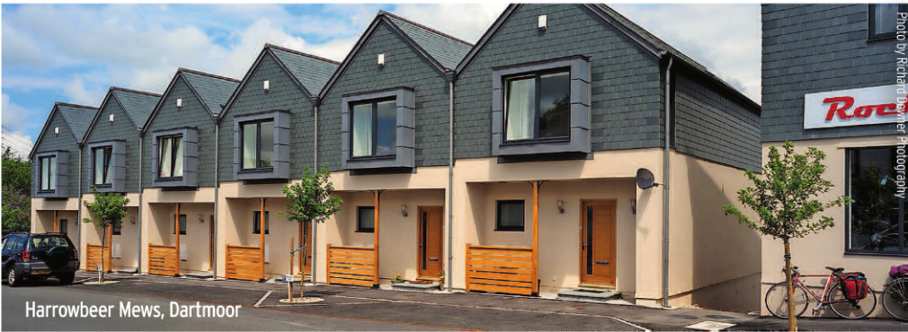
Harrowbeer Mews, Dartmoor

The man behind the look of a new sustainable development on the western edge of Dartmoor National Park has said it demonstrates how good planning works at its best - with the landscape and the community in mind.