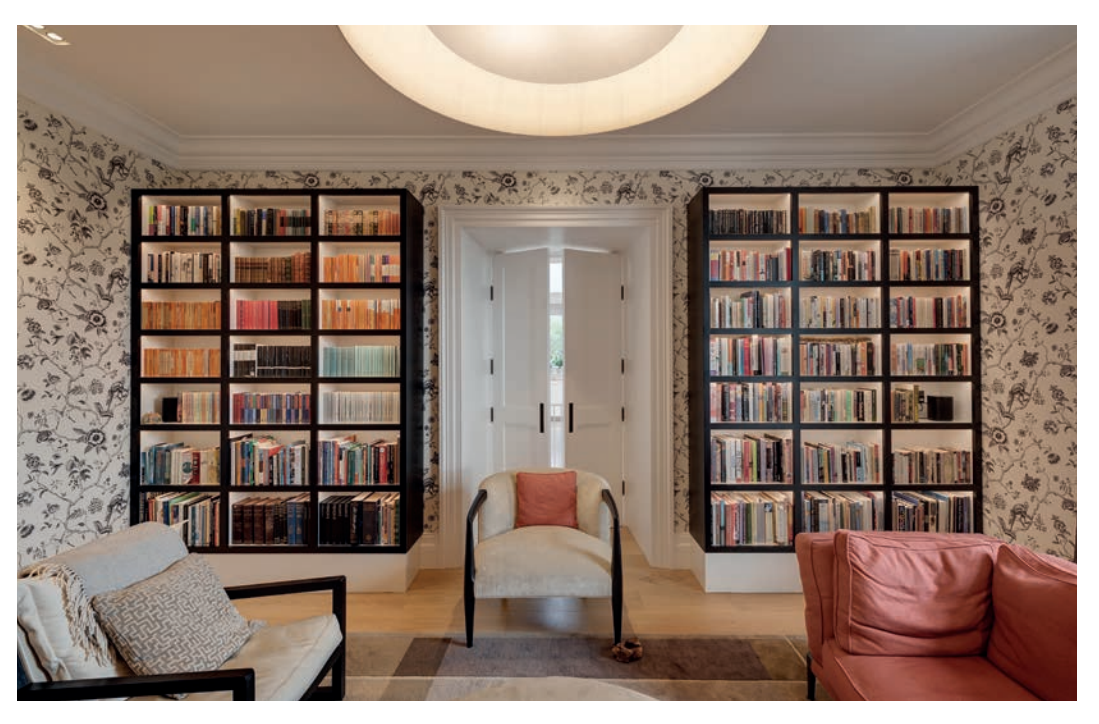
TOP LEFT An arrangement with bliss in mind