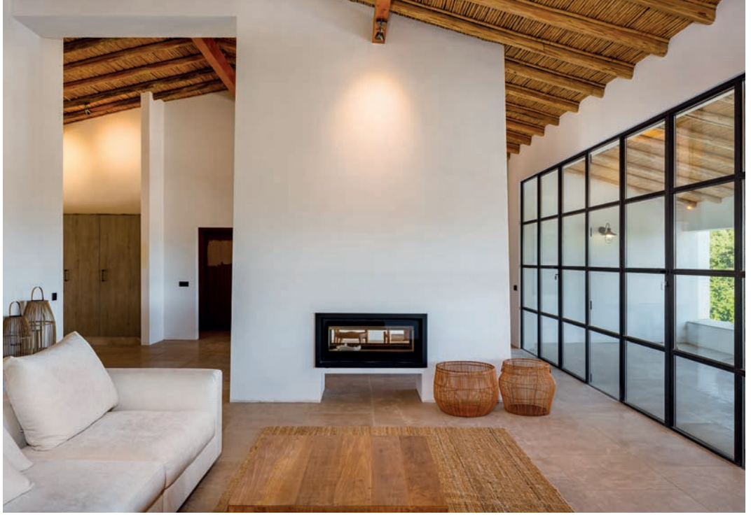
\begin{array}{l} TOP \\ A cosy farmhouse \\ atmosphere \end{array}