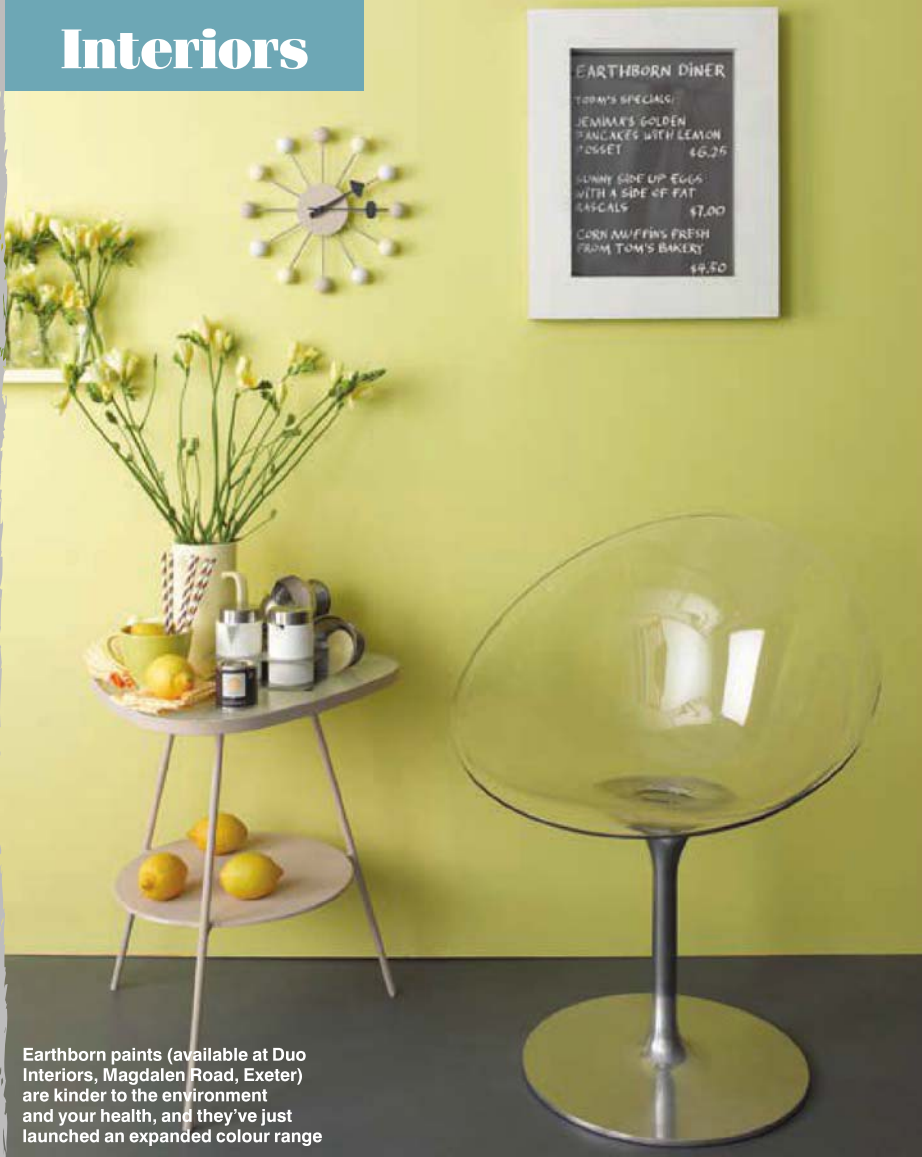
Earthborn paints (available at Duo Interiors, Magdalen Road, Exeter) are kinder to the environment and your health, and they've just launched an expanded colour range