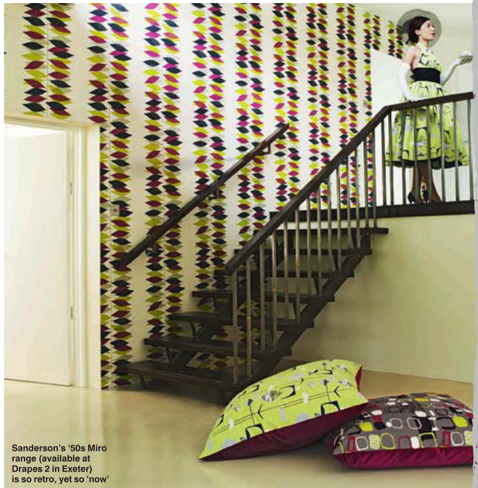
Sanderson’s ‘50s Miro range (available at Drapes 2 in Exeter) is so retro, yet so ‘now’

from bland. Bold, solid brights after a cold wet winter are an instant way to refresh and revive interior spaces. Use colourful mismatched cushions to instantly lift a room and use bold statement walls alongside pale, clean lines.”