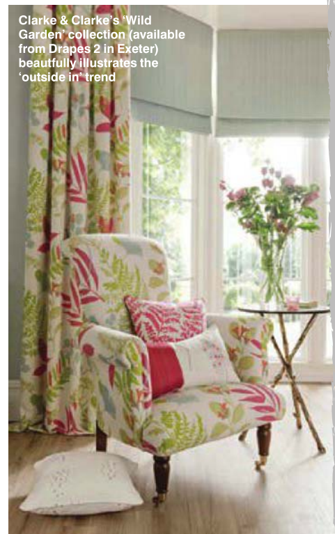
Clarke & Clarke’s ‘Wild Garden’ collection (available from Drapes 2 in Exeter) beautifully illustrates the ‘outside in’ trend

“The look is all about building on colour. Treat your rooms like pieces of artwork. Layer and keep on layering, adding different textures for depth and interest. Harmonise this colour palette with pale, neutral flooring, chalky whites, warm greys, natural woods and some polished, reflective materials.”