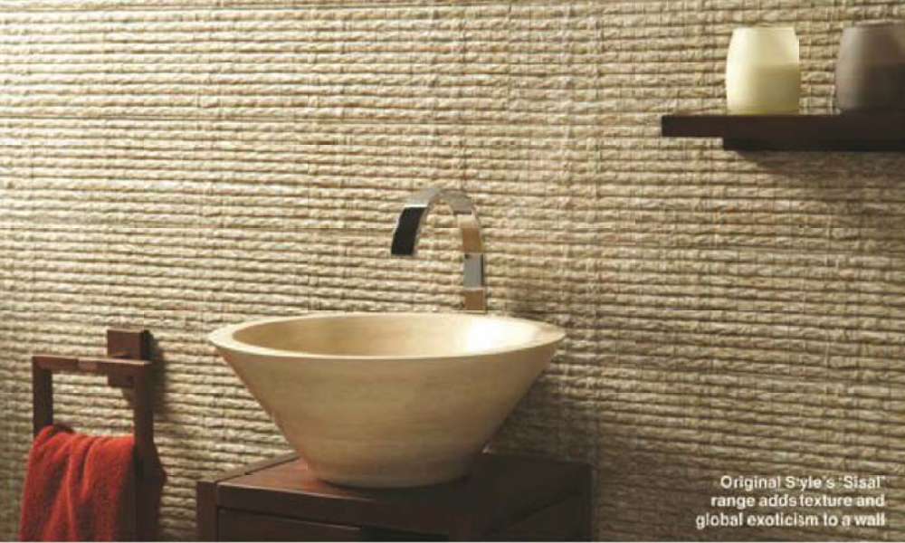
Original Style's 'Sisal' range adds texture and global exotism to a wall