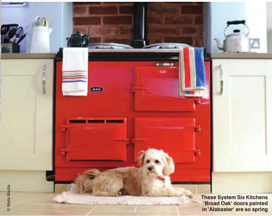
These System Six Kitchens 'Broad Oak' doors painted in 'Alabaster' are so spring