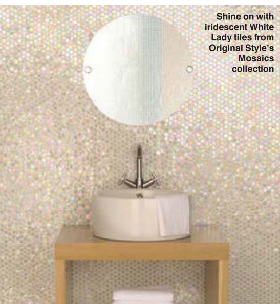
Shine on with iridescent White Lady tiles from Original Style’s Mosaics collection